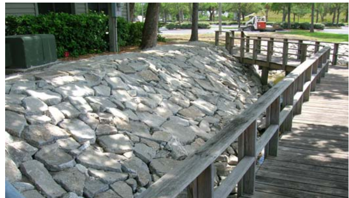
After - Rip Rap Installation