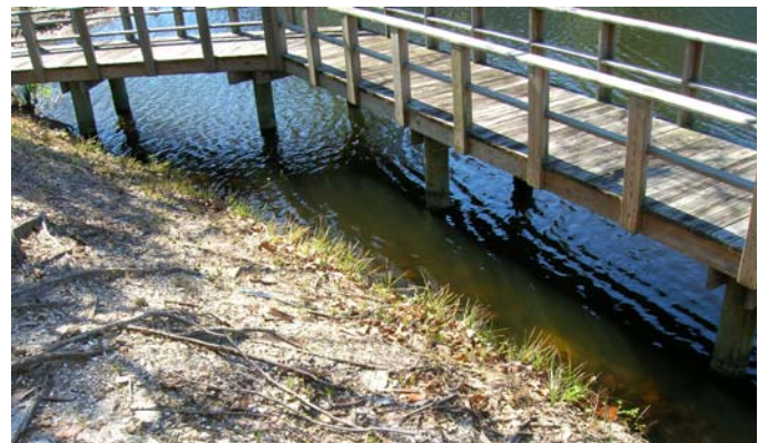
Before - Eroding Pond Bank